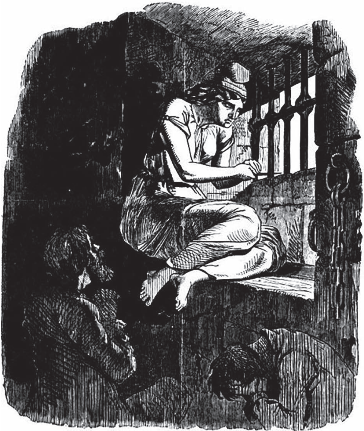
An illustration published in a British magazine, September 1856. It is entitled 'Liberty files the Austrian Bars of Italy.' 'Files' means cuts away.